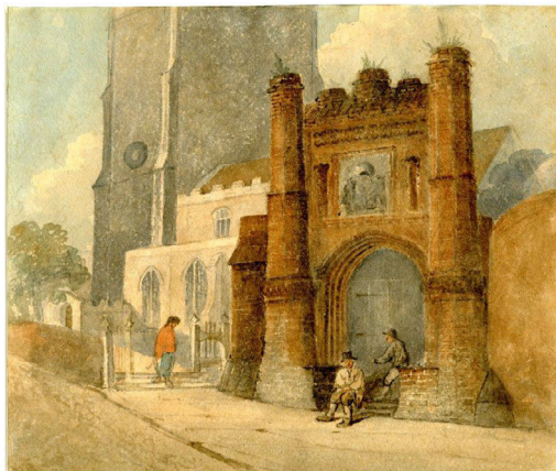
Ipswich Borough Council Collection painting. See Jan 9.

The next IAA newsletter covers the months of May to August 2020. It's never too early to send in your news, but the final copy deadline is Friday 27 March 2020. Email: rp.puzzlehouse@btinternet.com