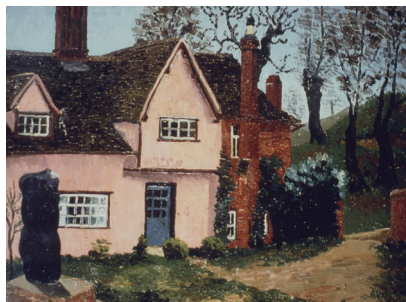
A painting by Cedric Morris