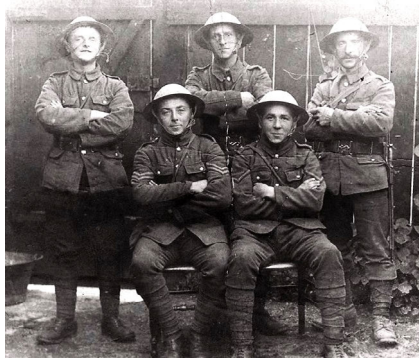
Remembering the Battle of Arras 1917

NEWSLETTER Issue XV (May-August 2017) www.ipswich-arts.org.uk